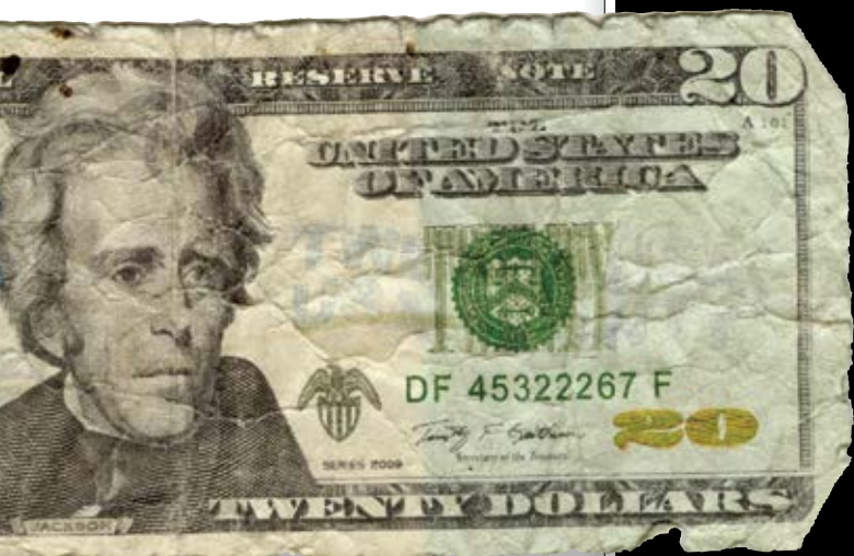
One of two counterfeit $20 bills found by The Extra on Natoma Street in July