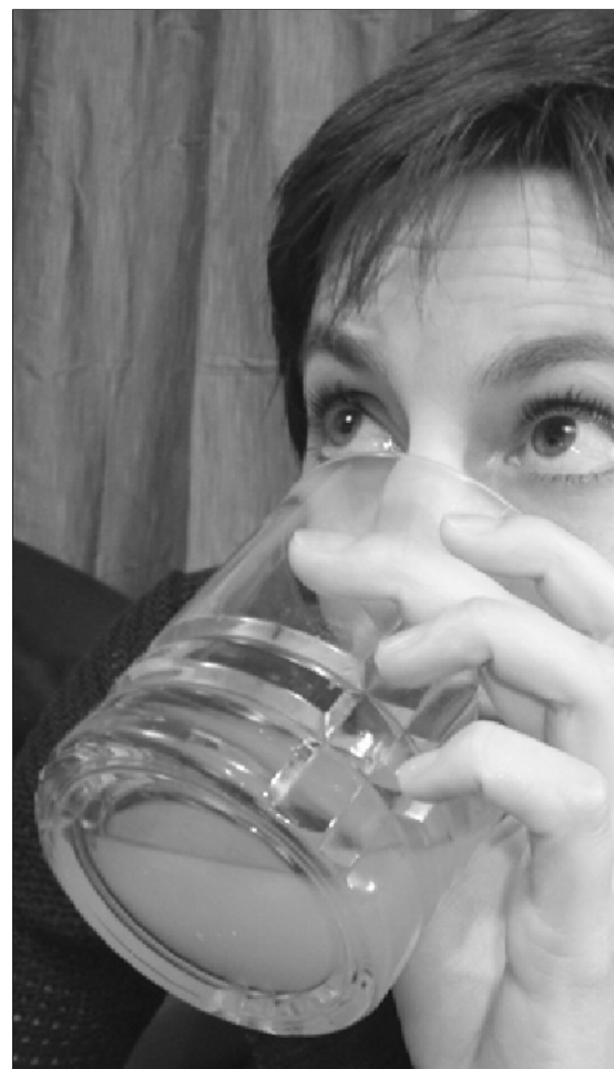
"Organic Boxed Chicken Stock" by Amy Tobin might