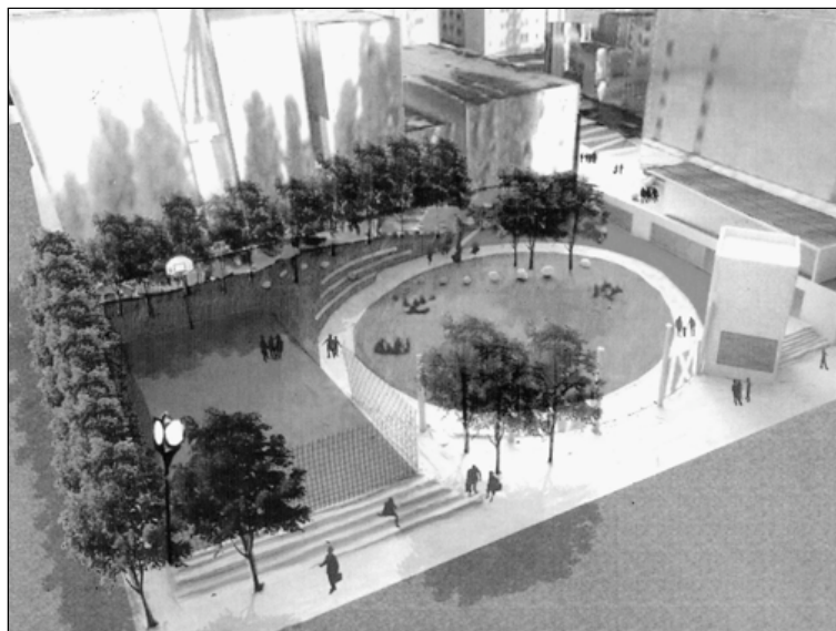
Artist's rendering of the pro bono redesign plan for Boeddeker Park.

"I echo the issue of whether this is safer than what we have now," he said. "Also, do we really need the basketball court? The current one isn't that functional. And do we need a better place to